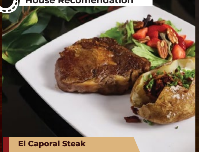
El Caporal Steak