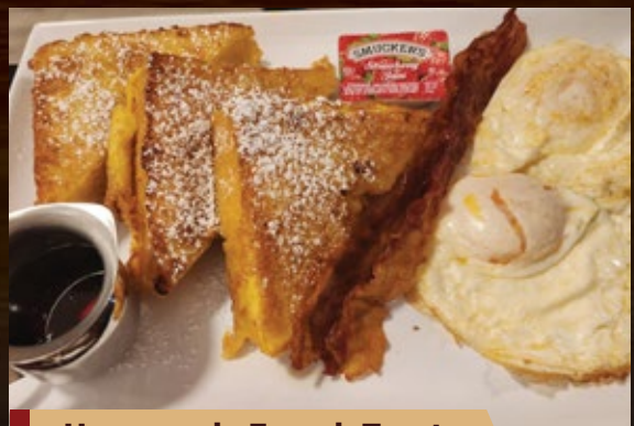
Homemade French Toast