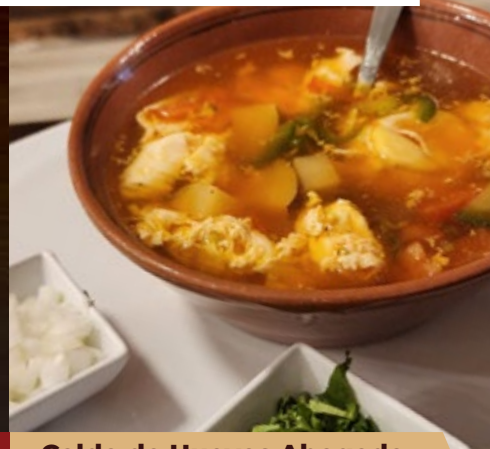
Caldo de Huevos Ahogado