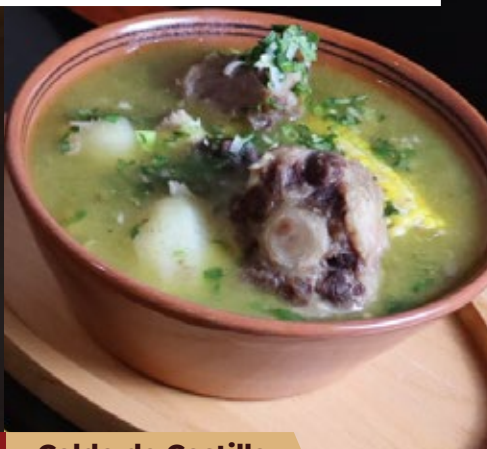
Caldo de Costilla