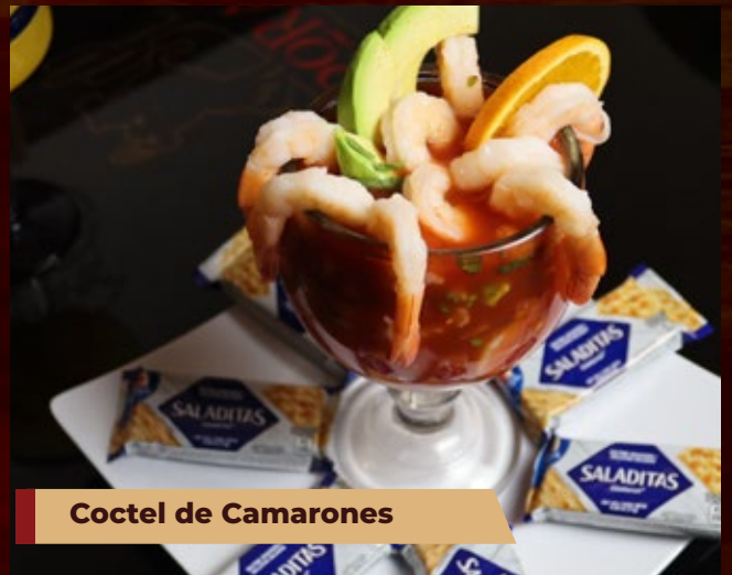
Coctel de Camarones