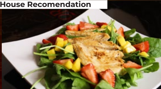
El Caporal Salad