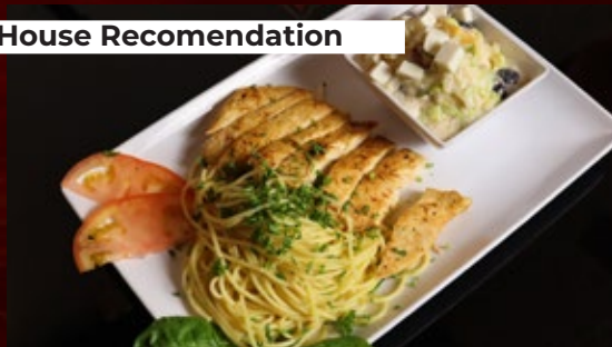
El Caporal Pasta